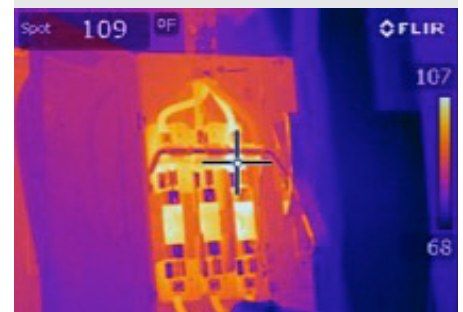
This is the thermal image of the same disconnect box. Note the abnormal heat level on the fuse clip.