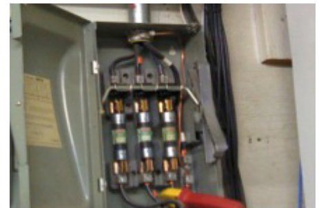
This image shows a typical disconnect box. When observed by the naked eye, nothing appears to be wrong.